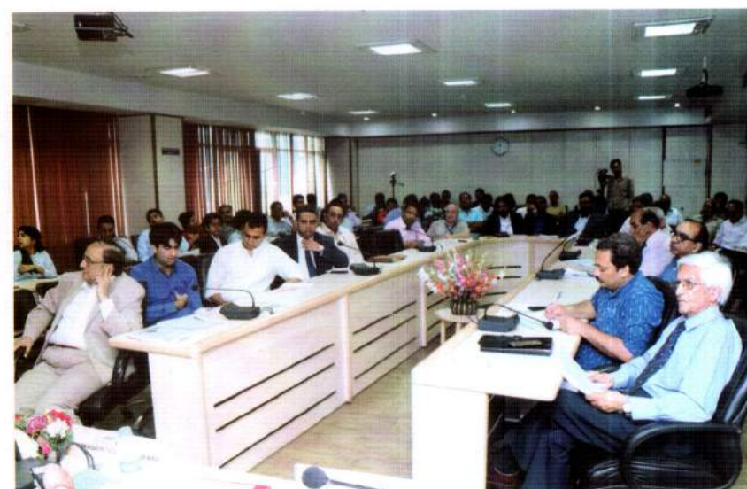
Participants during the Conference